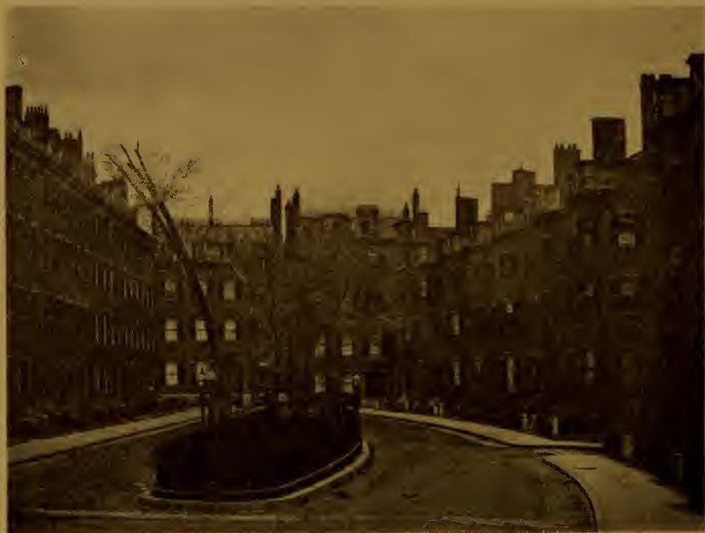
North End of Pemberton Square in 1875 Site of Court House on the left